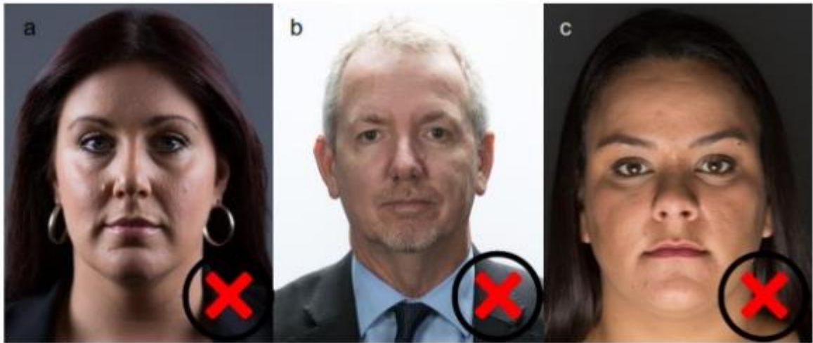
Non-compliant portraits: a) Side illumination, b) Top illumination, c) Bottom illumination.