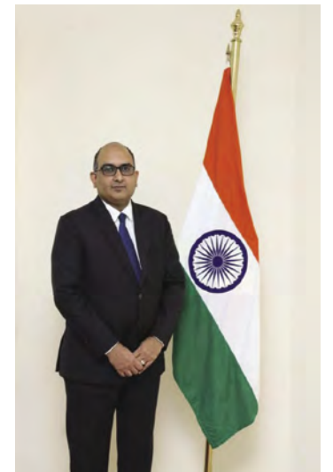
Shri Vipul Ambassador of India to Qatar