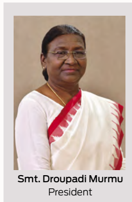
Smt. Droupadi Murmu President