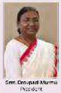
Smt. Droupadi Murmu President