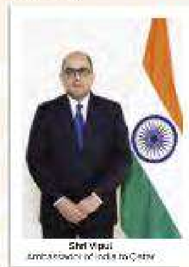
Shri Vipul Ambassador of India to Qatar