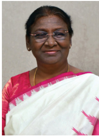
Smt. Droupadi Murmu President