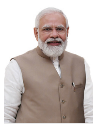
Shri Narendra Modi Prime Minister